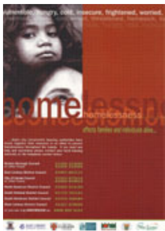
Poster and leaflet from campaign