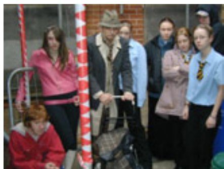
NACRO theatre group 'Think Twice' homelessness play